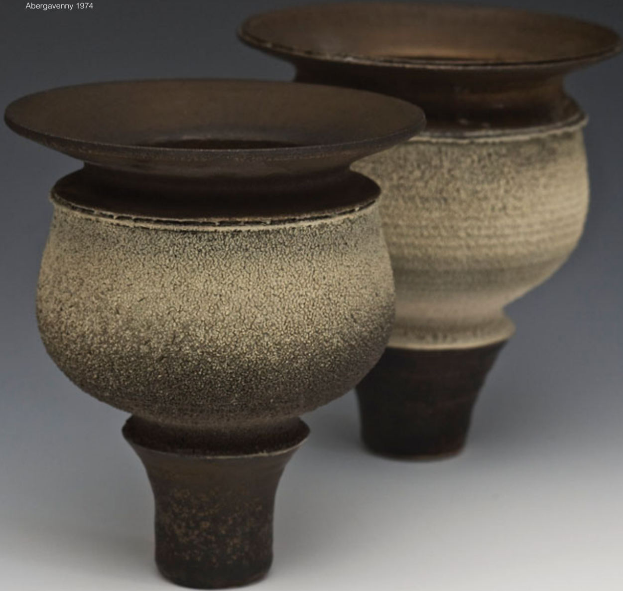
Alan Barrett-Danes Untitled Lustre Pot with Vitreous Slip Earthenware Abergavenny 1974