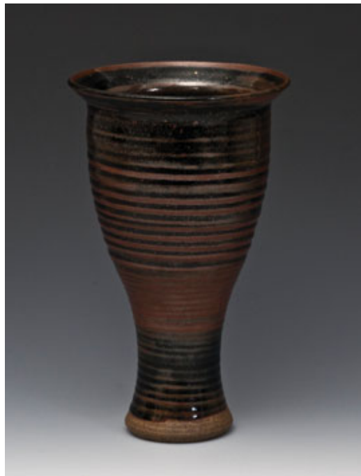
Alan Barrett-Danes Untitled Tenmoku Flared Pot Stoneware Cardiff 1969-70