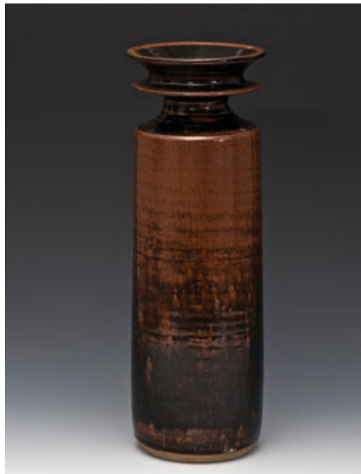
Alan Barrett-Danes Untitled Tenmoku Pot Stoneware Cardiff 1970