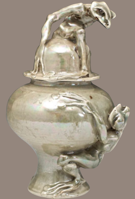
Below: Alan & Ruth Barrett-Danes Predator Animal Pots Porcelain Abergavenny 1975-78

obtaining some of the more beautiful glazes and colour combinations of the Sung period ... future kilns will contain examples of fine crackle in low-toned whites and greys, and perhaps in the long run we may attain to some blue that shall not too distantly resemble the wonderful tint of the 10th century Ch'ai vases'. 8