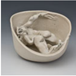
Images: Alan & Ruth Barrett-Danes Figure Bowls Porcelain Abergavenny 1977-78