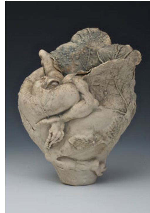
Alan & Ruth Barrett-Danes Animal Vessels Porcelain Abergavenny 1983-84

Initial ideas were explored through half-size maquettes to capture the effect but for the full-scale works she used a traditional potter's modelling system starting from a hollow form. Anatomical details were sometimes explored on paper although she rarely worked from life. By preference she used other images including the photographs of Eadweard Muybridge whose photographic analyses of moving figures provided a rich source of detail. The modelling of the heads were a favourite part and the most specific and detailed. They set the spirit of the piece. In thinking about these figurative pieces she draws a parallel with the concept of masquerade in which people reveal an