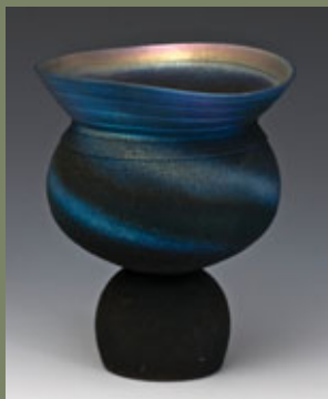
Alan Barrett-Danes Untitled Lustre Pot with Vitreous Slip White Stoneware Abergavenny 1985-87